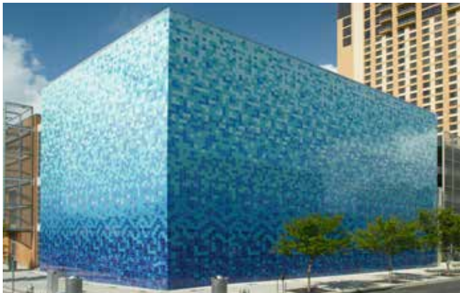
Garage, Austin, Texas, USA

Surfaces tiled with glass mosaic are fascinating due to their luminous reflectance, and at the same time they fulfil the demand for resistance and durability. The carrier board of the StoVentec G system forms an excellent adhesion primer for glass mosaic tiles as top layer. Besides glass mosaic, StoDeco Profiles, and Rustications, the StoVentec Carrier-Board Facade is also perfectly suited for the application of ceramics (StoVentec C), glass (StoVentec G), render (StoVentec R) and natural stone panel tiles (StoVentec S).