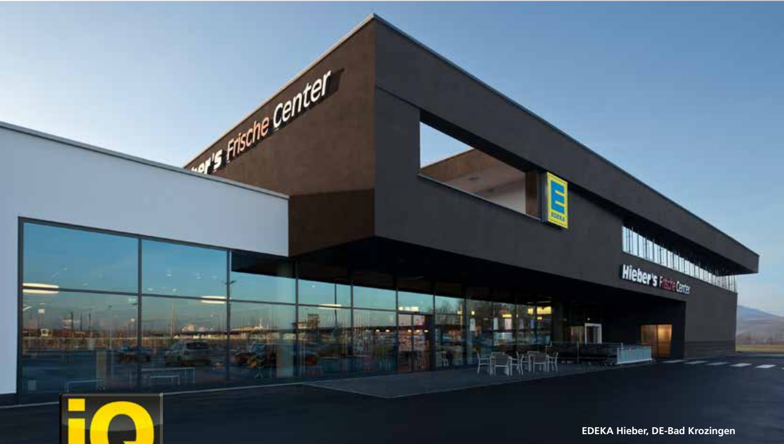
EDEKA Hieber, DE-Bad Krozingen